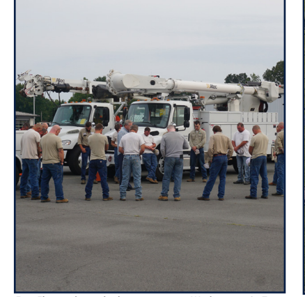
First Electric dispatched 21 crewmen to Washington-St. Tammany Electric Cooperative in Franklinton, LA to restore power after Hurricane Ida hit in August 2021.

We're proud of the job our employees do at First Electric! You – our members – responded to survey guestions about the level of service you received from our staff and field personnel. They scored over a 95% when asked about their overall level of satisfaction with service.