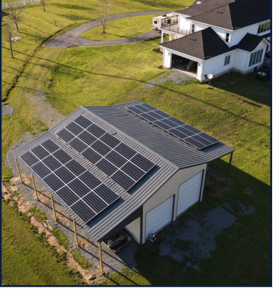
Solar Services installed a 17.325 kW solar array in Humphrey, Arkansas

With over 900 cooperatives in the country, it creates a great network to help in times of need. One example is during storm restoration, cooperatives extend mutual aid to other co-ops and utilities to restore power to their members and customers quickly.